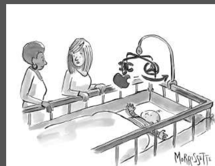
“ALEXA PICKED IT OUT.”